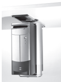
Jaw with CPU

Our health-positive products help people work at their most safe, effective, and motivated levels, so everyone can thrive.